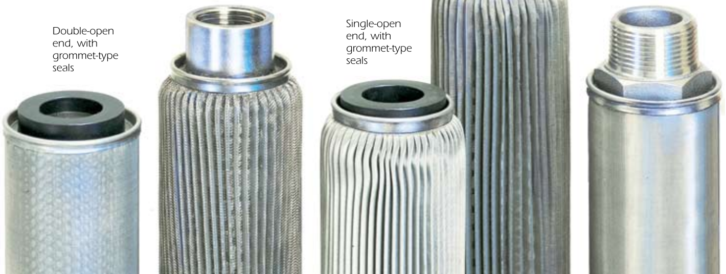
Single-open end, with male NPT connection